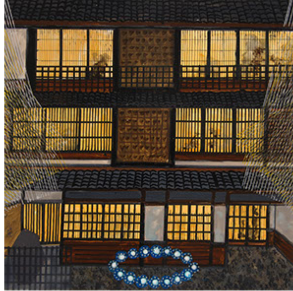
Michiko Itatani, Personal Codes (from Cosmic Cube 2019-K-18), 2019. Gouache, ink & prisma color pencil on board, 6 x 6 inches. Personal Codes (from Cosmic Cube 2019-K-12. 2019). Gouache, ink & prisma color pencil on board, 8 x 8 inches.

Personal Code (from Cosmic Cube 2019-K-12) give us a close-up of the building with a slight Roger Brown twist, featuring silhouettes in the windows. The line fields are present on each side, like drapes flanking a window or side flats defining a stage set, while the ring of lights hover over the floor of what appears to be a patio. The Cube sits on the lower left protected by a grating and guarding the entrance to the house. In this piece, Itatani uses repeating patterns, in this case the window gratings, to create an almost symmetrical, abstract composition that almost eclipses the straightforward rendering of the house.