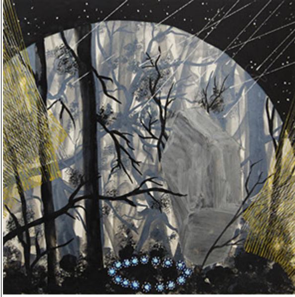
Michiko Itatani, White Night (from Tesseract Study 2019-K-28), 2019. Gouache, ink & prisma color pencil on board, 8 x8 inches.

The otherworldliness is reinforced in White Night (from Tesseract Study 2019-K-28). This small 8-inch square painting has an outdoor setting. A protective white bubble houses the Cube, now a prominent object in the painting in a forest of bare trees that faintly suggest anthropomorphic forms—if you don't focus too sharply. The ring of lights seems to rest on the ground next to the Cube. While the line fields, this time in prominent gold, flank the painting as usual, but here, they suggest curtains flying in the breeze of an open window. And above, a shower of meteors rains down out of a black night sky. All in all, we are now in a science fiction setting.